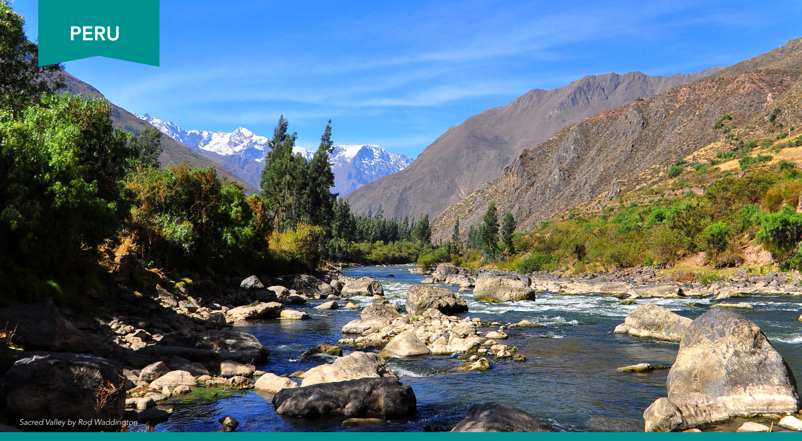
Sacred Valley by Rod Waddington